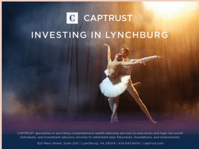
Sample Sponsor Slide in Charlottesville Ballet's "Digital Slideshow"

PLEASE SUBMIT ALL MARKETING MATERIALS ONLINE.