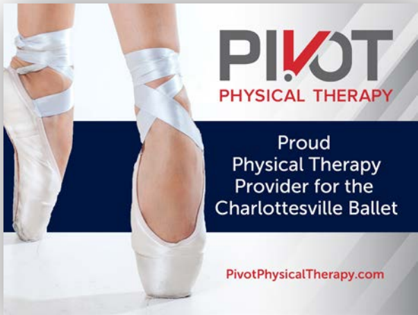
Sample Sponsor Slide in Charlottesville Ballet's "Digital Slideshow"

PLEASE SUBMIT ALL MARKETING MATERIALS ONLINE.